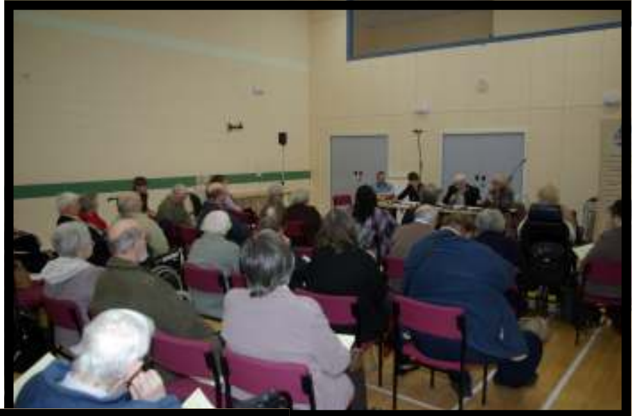
Some of the People in attendance at the meeting