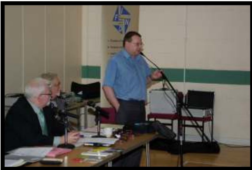
Some of the People in attendance at the meeting